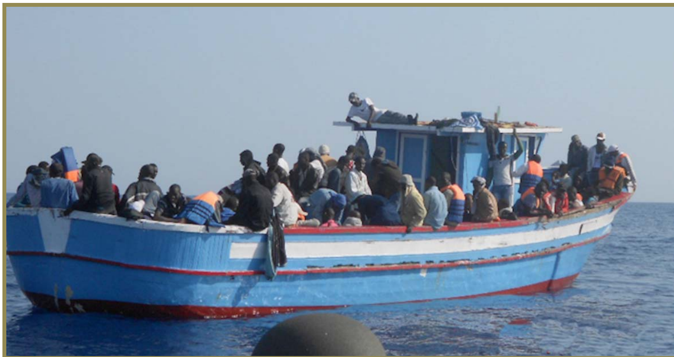
The migrant boat as the Spanish pulled alongside last Sunday morning. [Photo courtesy of the MINISTERIO DE DEFENSA DE ESPAÑA (SPANISH MINISTRY OF DEFENSE)].

floodgates” of migration will probably not be discussed by the European members of the INTERNATIONAL CONTACT GROUP ON LIBYA meeting in Istanbul now – though the Spanish, Italians and Maltese may share a word or two on the sidelines – but African migration will not be far from their thoughts.