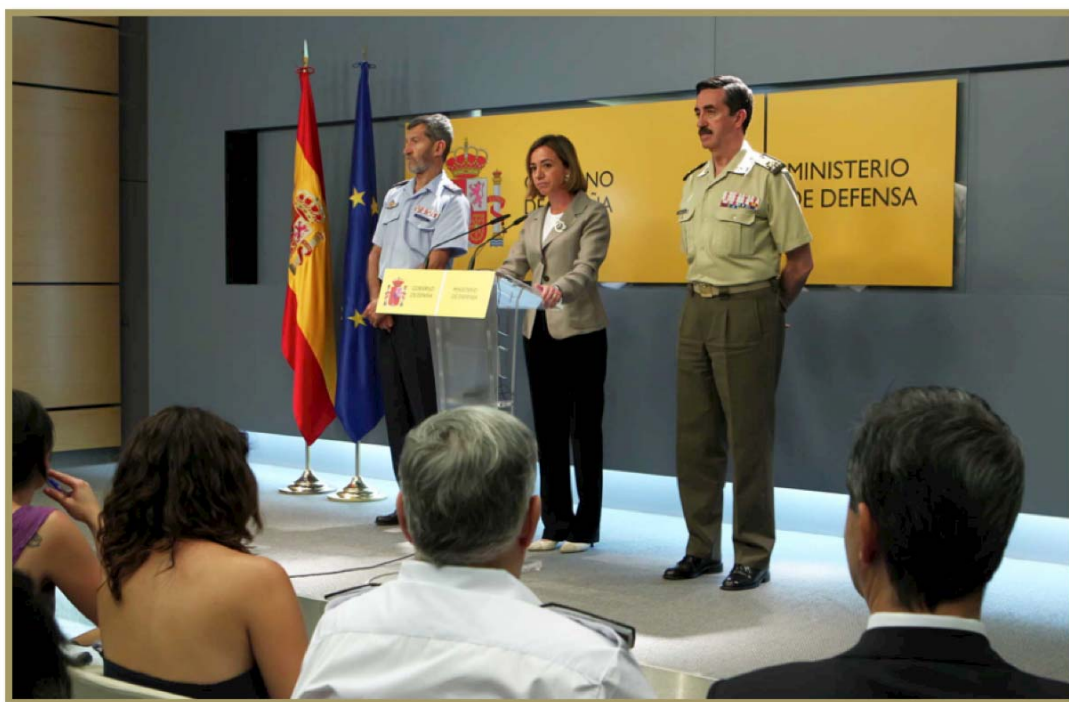
Migrants and Malta put Spanish Defense Minister Carme Chacón under the lights in Madrid, but at the heart of this dispute, an Italian accent may have been the most prominent.

Qaddafi won millions in deals, not to mention respectability, for Libya’s role in “pilot projects” to stem the flow northward, but his crowning achievement came last September. In a meeting with the EUROPEAN UNION, he warned unashamedly that Europe would become “black” unless migrants were turned back. You can’t imagine the consequences, he told the E.U. breathlessly: