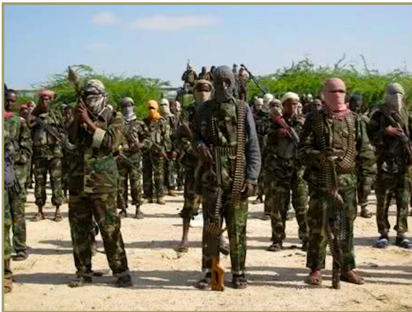
The “New Humanitarians” of Somalia? Don’t count on it. A (Un-marked photo of AL SHABAAB fighters from a Somali source.)

Yesterday, The Lads expressly asked for help from “infidel” agencies, not just “Muslim” ones. Tellingly, they made that announcement to a Somali television outlet they captured a few days ago. Initially at least, they issued no written statement. Instead, AL SHABAAB spokesman Sheikh Cali Maxamuud Raage ( Cali Dheere ) was “interviewed” by the TV station they now control in Shabeellada Dhexe (Middle Shabelle administrative region), one we are calling, after “Bollywood” of India, “SHABAAB-ywood.” The Lads posted nothing on their own Jihadi sites, at least not initially (although they will soon have to explain themselves to global Jihadis at some point). Cali Dheere’s brief televised announcement: