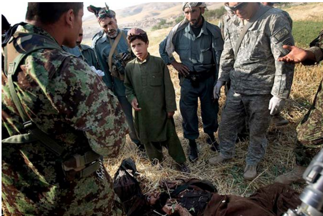
One reason the TALIBAN targets children is photographic proof that some of them are tipping off pro-government forces. The TALIBAN fighter in the permanent prone position was observed by the young boy loitering numerous times in the village of Khushi Khona, Herat Province, in June. U.S., Italian and Afghan National Army soldiers moved in to capture him, but he fought back and was taken out. He possessed detonators and other IED-making materials. (Un-marked photo at a jihadi site under this heading: “The Crusader Forces are using children to kill TALIBAN fighters!”)